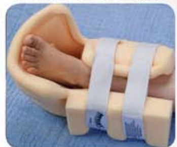
Heelift® Suspension Boot