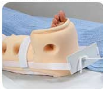
Heelift® Traction Boot