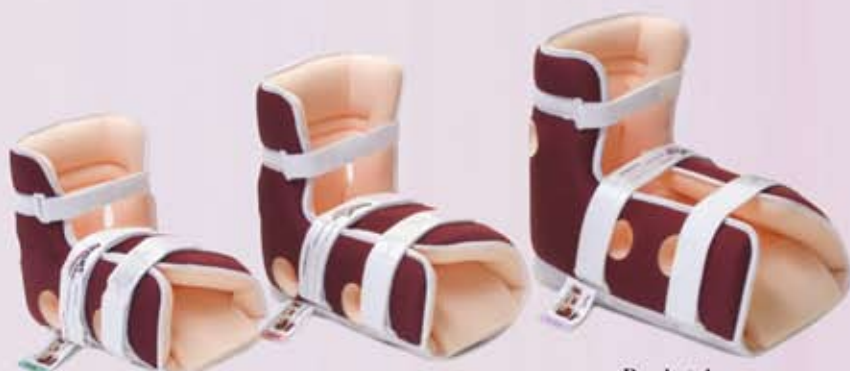
Petite 7.75" H x 10.5" L