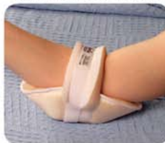
Elbowlift® Suspension Pad