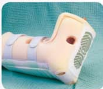
Heelift® AFO Boot